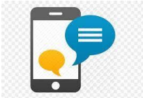
SMS & WhatsApp