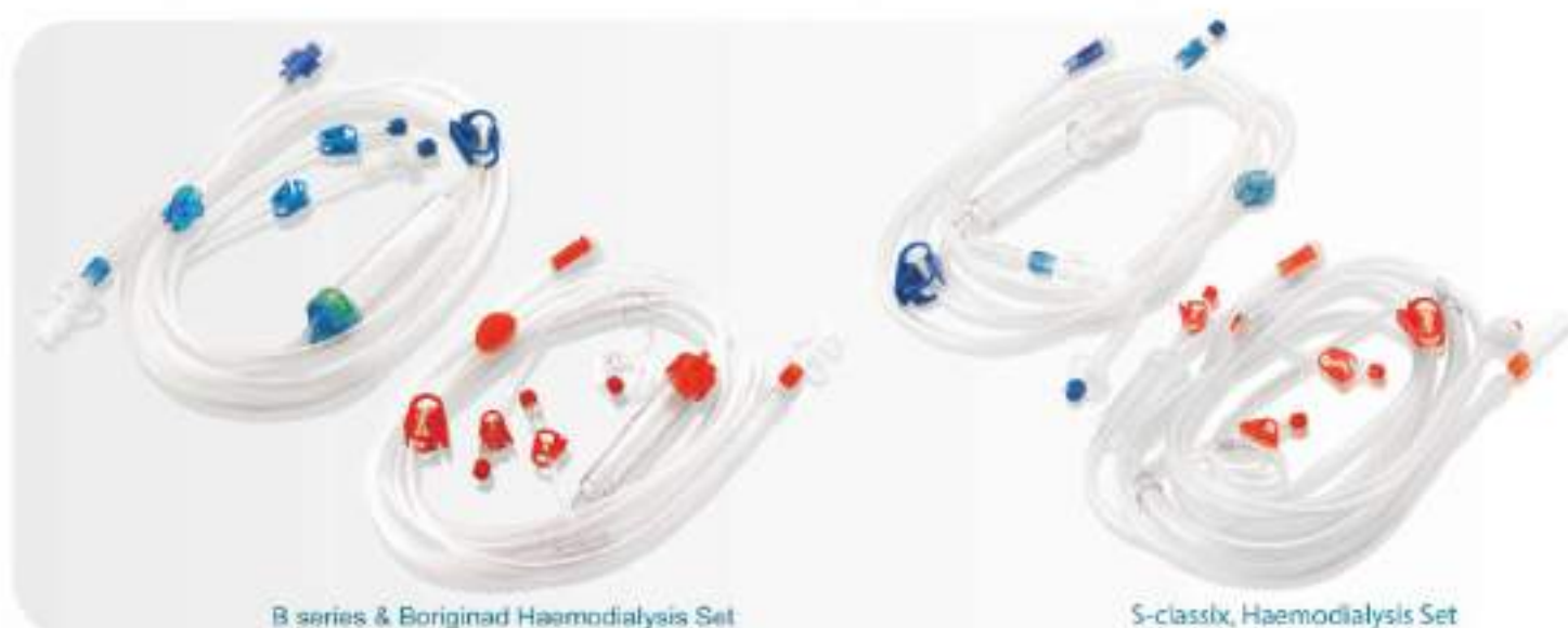
B series & B original Haemodialysis Set

Including arterial and venous sets, these sets are connected to a proper fistula needle (venous set to venous fistula needle set and arterial set to arterial fistula needle set) and hemodialyzer during hemodialysis. The arterial set transfers the blood from patient's body to hemodialyzer and the venous set returns it from hemodialyzer back to the body.