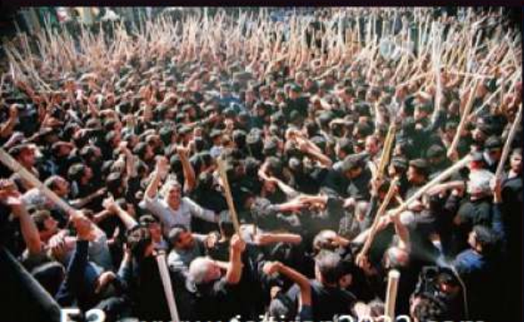
Qālišuyān rituals of Mašhad-e Ardehāl in Kāšān