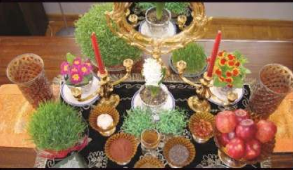
Nawrouz, Novruz, Nowrouz, Nowrouz, Nawrouz, Nauryz, Nooruz,