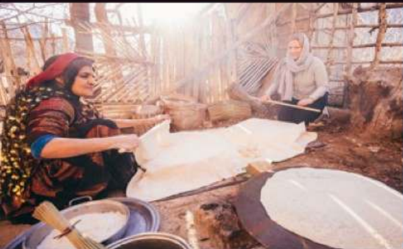
Flatbread making and sharing culture: Lavash, Katyrma, Jupka, Yufka