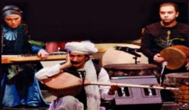
Music of the Bakhshis of Khorasan