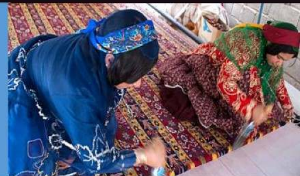
Traditional skills of carpet weaving in Kashan