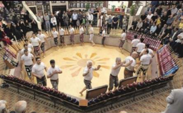
Pahlevani and Zoorkhanej rituals