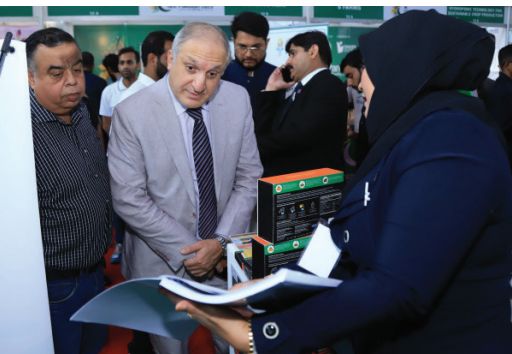
An international startup showcases their innovative idea to the CEO of SMEDA at SEE Pakistan 2023