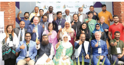
Group photo of training participants with trainers and chief of the quest