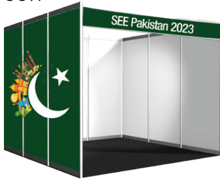
Shell stall 3*3 M