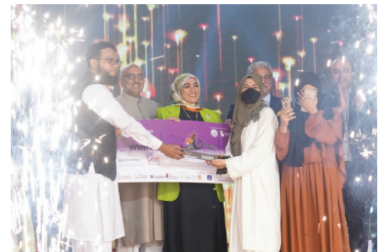
Team Milkify securing the prize money of 3 lacs rupees.