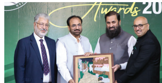
Team SEE Pakistan welcoming guests.