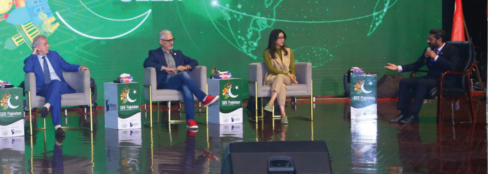
Panel discussion at SEE Pakistan.