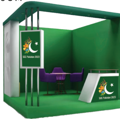
Double 6*3 M