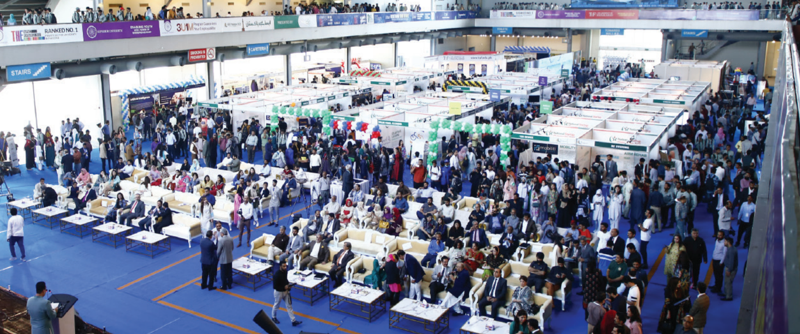
Footfall at SEE Pakistan.