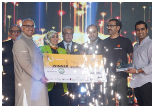
Team Milkify securing the prize money of 3 lacs rupees