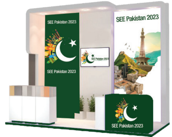
Standard 6*6 M